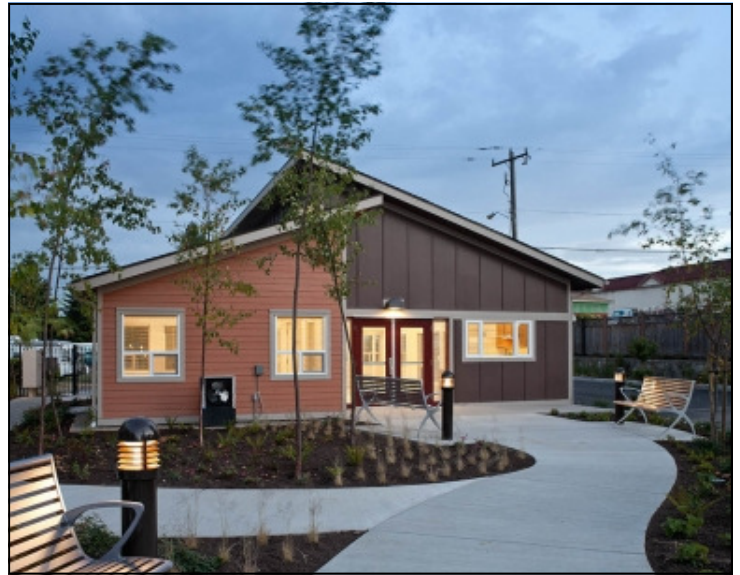
Pacific Court Community Center: Supportive Public Housing in King County, Washington.

Pacific Court is a joint effort between KCHA and Sound Mental Health providing permanent housing and supportive services to formerly chronically homeless adults with disabilities. KCHA owns and manages the complex which is an example of the "housing first" approach to homelessness in which vulnerable, at-risk households are considered to be more responsive to intervention and social services support after they are in stable housing.