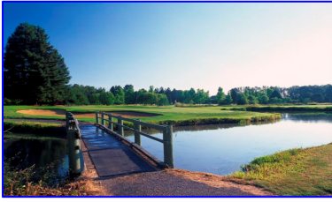
Hole 13 on the Greenback Course at Heron Lakes Golf Club

PNRC-NAHRO will hold its 9 th Annual Scholarship Golf Tournament on Sunday, April 29, 2012 to raise funds for the scholarships awarded yearly to residents of our members' affordable housing programs. This year's Tournament will be at Heron Lakes Golf Club (3500 N. Victory Blvd. in Portland, OR) about 7.5 miles from the Doubletree Hotel (Lloyd Center) where the PNRC-NAHRO 2012 Annual Conference will be held April 29 – May 2. Heron Lakes Golf Club (Greenback Course) offers terrain suitable for golfers at all skill levels. For more information about the course go to www.heronlakesgolf.com or call 503-289-1818.